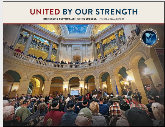
Minnesota Department of Veterans Affairs Design and development of 2023 Annual Report